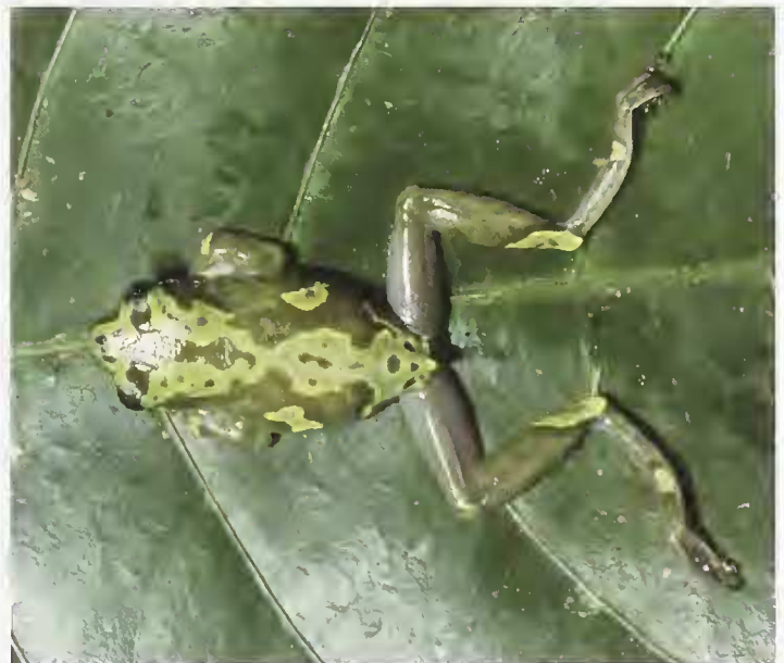
Fig. 1. Dorsal view of male holotype (in PhJ) of Hyperolius dintelmanni sp. nov. (ZFMK 67871).